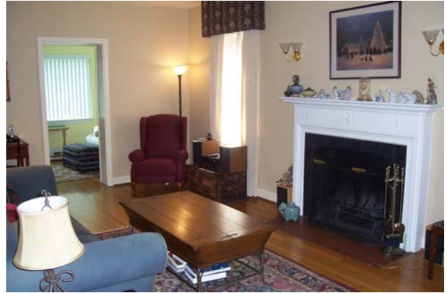
LIVING ROOM W/FIREPLACE