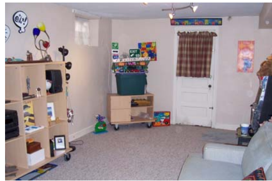
AU PAIR/IN LAW SUITE