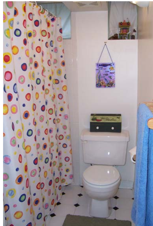
AU PAIR/IN LAW BATHROOM