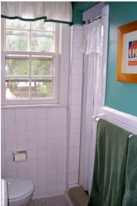
EN SUITE MASTER BATH