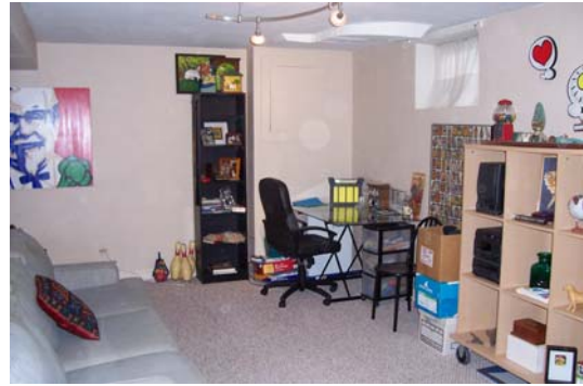
AU PAIR/IN LAW SUITE