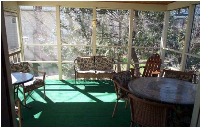
Three Season Large Screened Porch