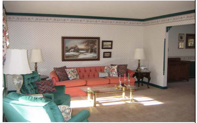
Formal Living Room