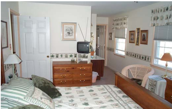
Master Bedroom Suite