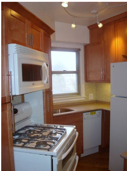
New Kitchen with Granite & Bamboo Floors