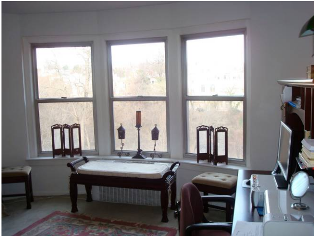
Large Living Room Area