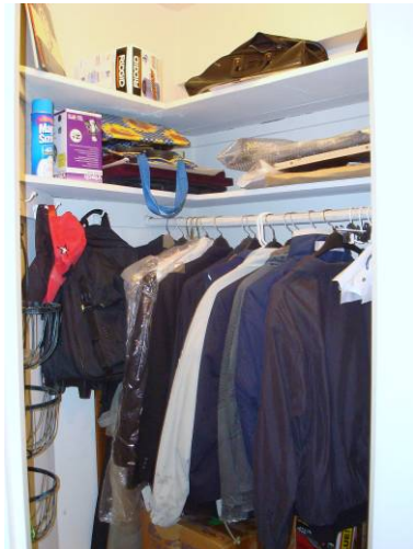
One of Four Walk In Closets