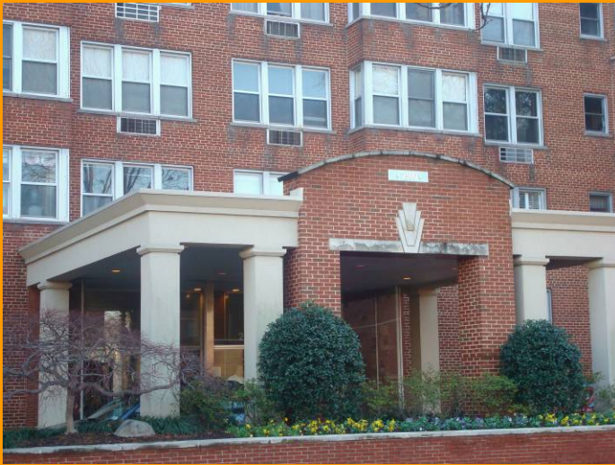
Welcome to Gateway Georgetown