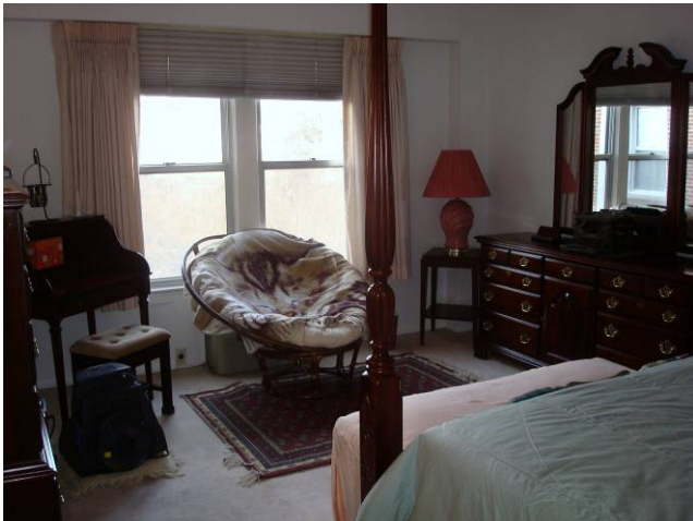
Bedroom with Walk In Closet