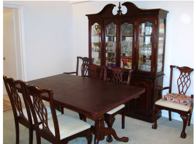
Large Dining Room Area