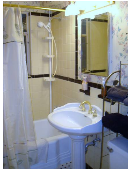
Bathroom with Window in Shower