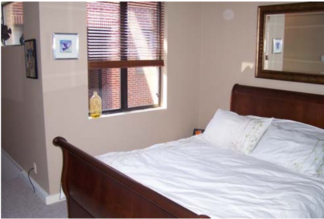
Upper Level Master Bedroom Suite