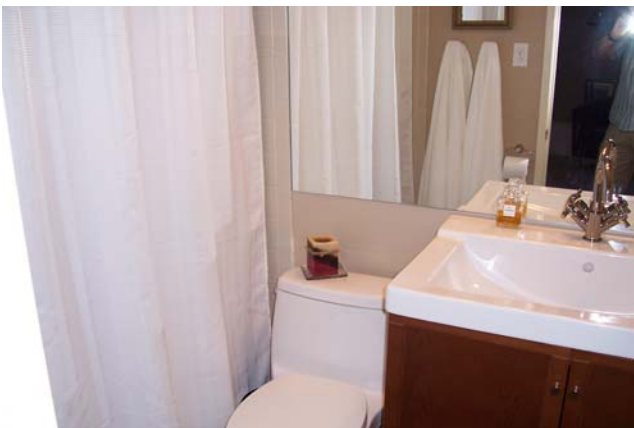
One of Three Updated Bathrooms