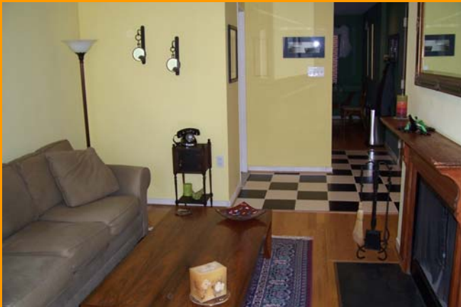
Large Living Room w/Fireplace Foyer and Half Bath