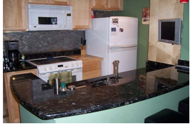
Updated Kitchen with Granite Breakfast Bar