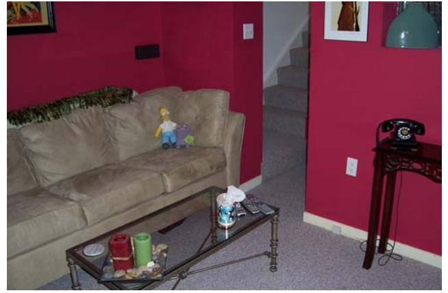
Lower Level Master Bedroom Suite