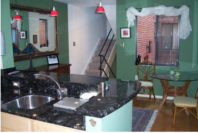
Open Kitchen with Separate Dining Area